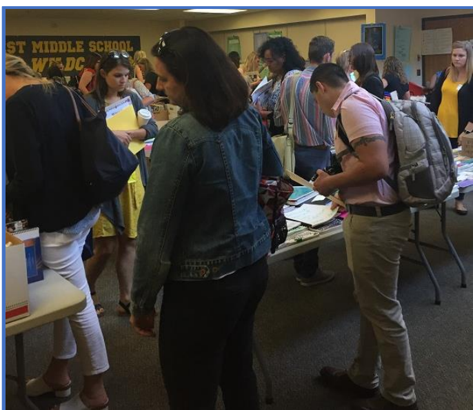
Teachers searching for treasures!

Additional photos available on the website, http://dkgcolorado.weebly.com/